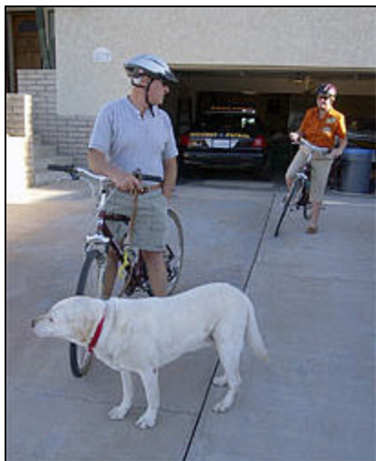
... and get ready for a bike ride near their Needles home. He retired on disability from the California Highway Patrol after a heart attack; his wife, still a CHP officer, plans to retire in July after 30 years of service.