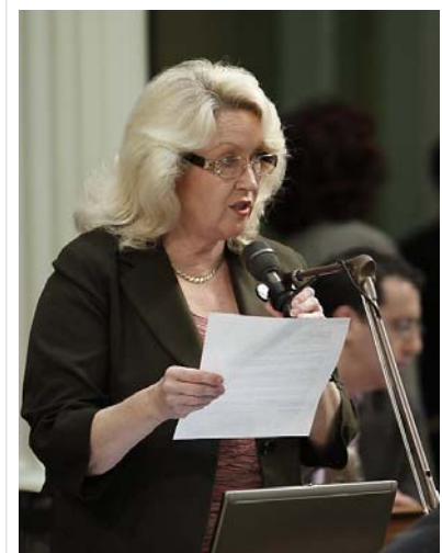
Assembly Republican leader Connie Conway estimates that an average family will save $1,000. Credit: Rich Pedroncelli / Associated Press 2010